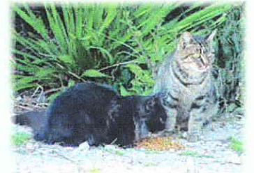
*Two feral cats eating at drive-thru restaurant colony

The cats might not remember the two trappers who got so excited each time a trap door slammed closed and who are very thankful they were given the opportunity to help these beautiful animals have a better chance of survival, but one thing is for certain, the two trappers will never forget them. ♡